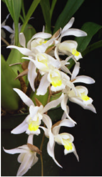
Coelogyne massangeana from Last year's TOS Auction

R emember that as plants get bigger and require larger pots, the medium used must be coarser so that oxygen can penetrate to the center of the pot.