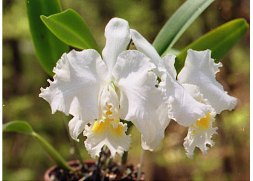
Cattleya Carl Hausermann' Spring Beauty' From last year's TOS Auction