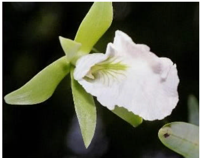
Encyclia Mariae from Last year's TOS Auction

Slime trails give slugs away, while tiny bites in new roots can tell you that pill bugs and snails are in the medium. Next month's tips column will get you started on pest control.